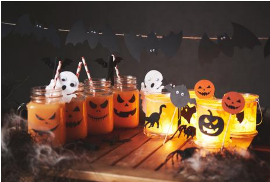
Scary Halloween decoration