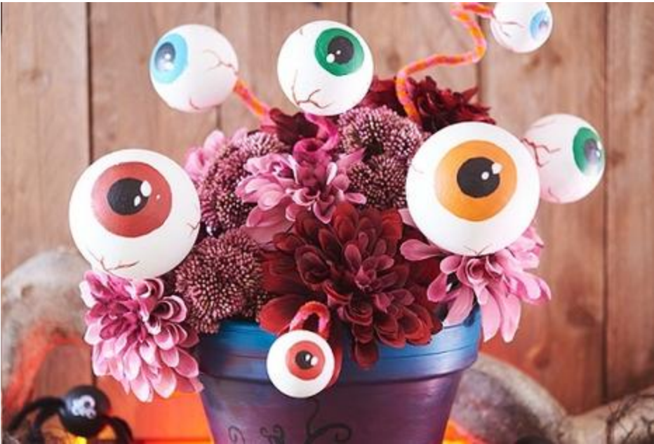
Halloween decoration: creepy styrofoam eyes