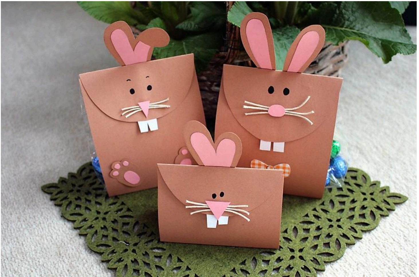
Easter bunnies gift wrapping: Beautiful and individual

Easter is just around the corner, and what better way to surprise your loved ones than with delicious treats in homemade gift wrappings? Let your creativity run wild and make an enchanting Easter bunny packaging that will showcase your homemade delicacies in style. In this step-by-step guide, you will learn how to create a unique gift idea for Easter with just a few materials and a little skill.