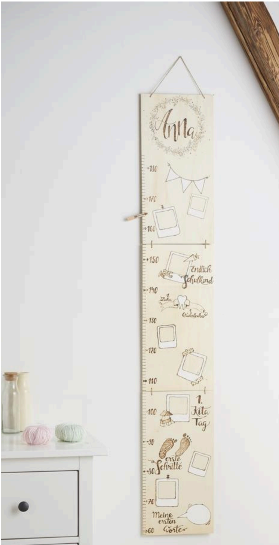
The yardstick in the raw version: